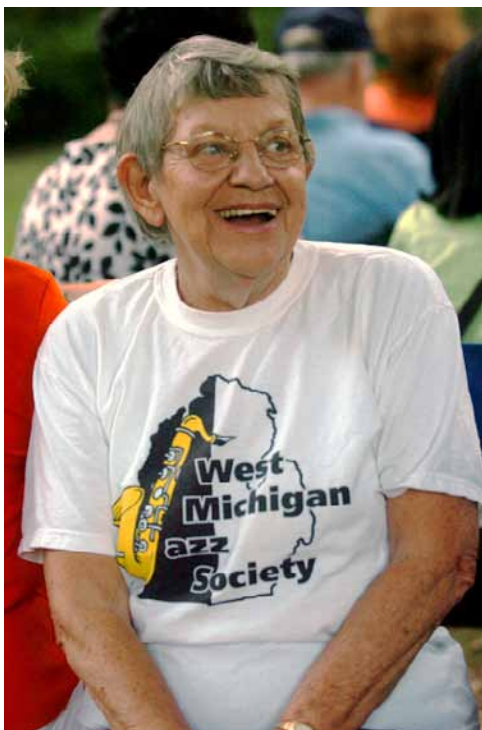
Caught looking at the zoo

stage lecturing to Americans about jazz and civil rights, and that even though I played the flute and saxophone in a manner that was way too 'modern' for her tastes, she wanted me to consider joining the WMJS Board. I went along to a Board meeting a couple of weeks later, enjoyed the experience, and was honored