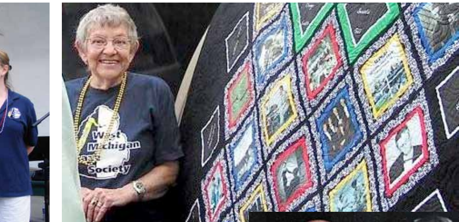
a commemorative quilt consisting of

no WMJS scholarships for student musicians, and no 'Jazz Notes' journal, replete with Betty's superbly written album and jazz book reviews.