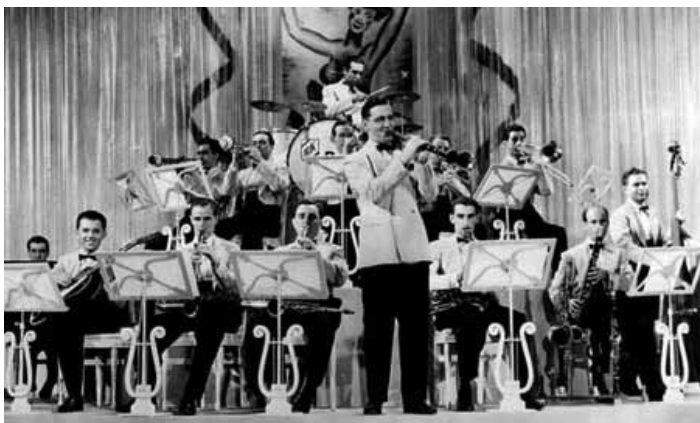
Above, the Benny Goodman Orchestra. Right, the Duke Ellington Orchestra.

encouraged them to express themselves in the most exciting way possible! For the next 13 years Granz formed groups that criss-crossed the USA and Europe playing concert halls, where the other big bands of the '30s to '50s mainly played dance halls, large supper clubs, and toured colleges. Their core audience was people who wanted to dance to big band music. The players inspired the dancers, and the dancers inspired the players, while a hard core gathered around the bandstand just listening intently.