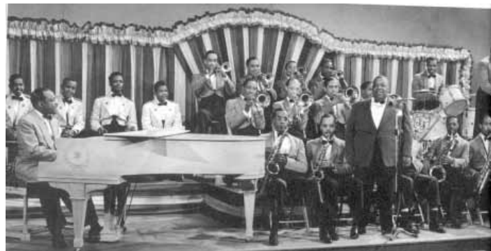
Left, the Gene Krupa big band. Above, the Count Basie Orchestra.

individual players as well as inspiring the soloists. The rhythm flows as well as it swings; it builds with textures of energy, urgency, and relaxation. Asked what his music was about, Basie would rely, "Pat your foot."