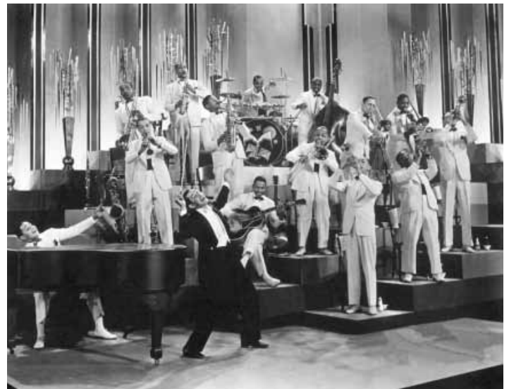
Above, the Cab Calloway Orchestra dressed to the nines. At left, Artie Shaw conducting his big band. Below, the Glenn Miller Orchestra.

Goodman's title as "King of Swing" was strongly challenged by Artie Shaw, while a host of black bands got plenty of work but didn't attract at the level of the white bands for several years. These included Earl Hines, Cab Calloway, Louis Armstrong, Count Basie, Chick Webb