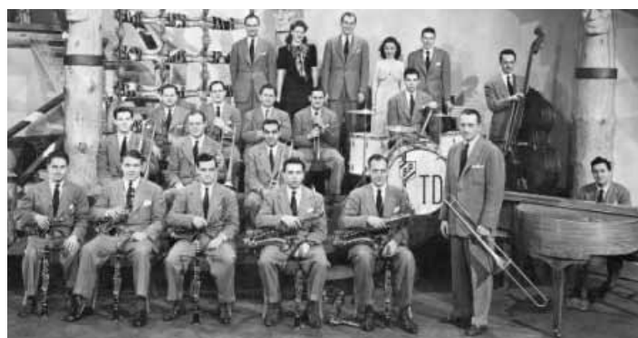
Above, the Tommy Dorsey Orchestra.

When asked the above question, Grand Rapids Jazz Or-