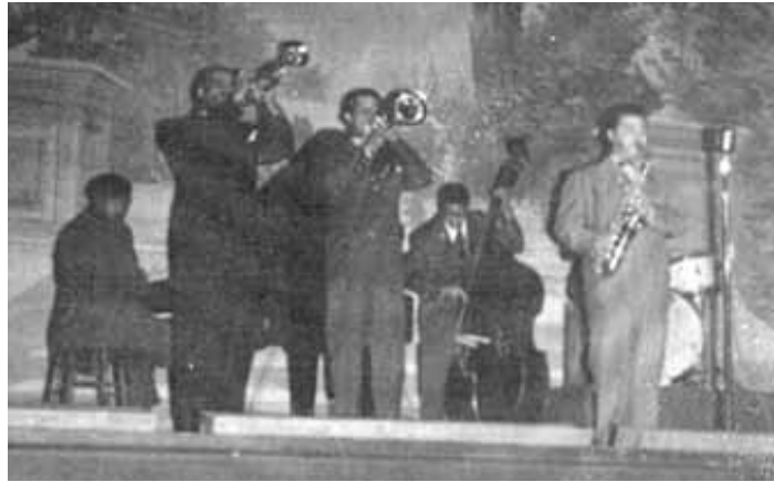
Jazz at the Philharmonic played the Black & Silver Room at the Civic Auditorium in Grand Rapids Oct. 3, 1947

The biggest success story of the swing era belongs to Chicago clarinetist Benny Goodman, who included room for lots of improvisation in his charts. He also made many records with his trio, quartet, and quintet that were all jazz, with pianist Teddy Wilson, Lionel Hampton on vibes, and guitarist Charlie Christian. His success inspired his former sidemen