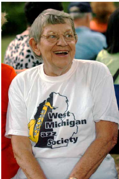
Caught looking at the zoo