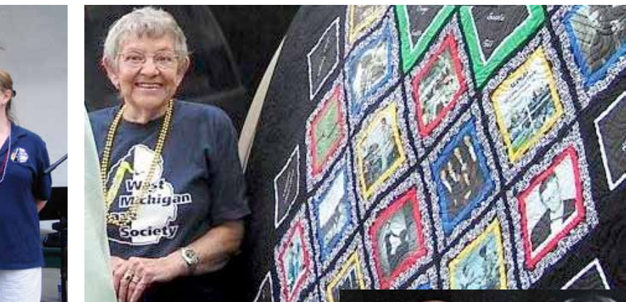
a commemorative quilt consisting of

no WMJS scholarships for student musicians, and no 'Jazz Notes' journal, replete with Betty's superbly written album and jazz book reviews.