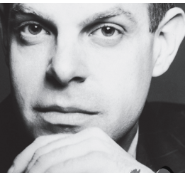
Bill Charlap Trio March 14, 2013 One of the world's leading jazz pianists in a stellar trio performance.

Concert tickets: $35 / $30 / $10 student Pre-concert reception: $15