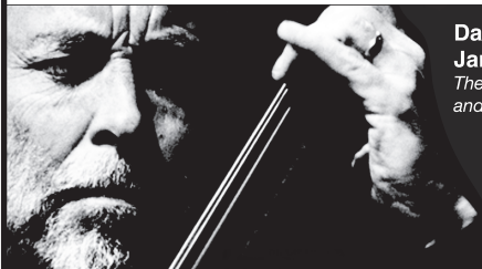
Dave Holland Quintet January 24, 2013 The award-winning bassist, band leader and master of tone and rhythm.

Tickets are also available for a pre-concert wine and hors d'oeuvres reception.