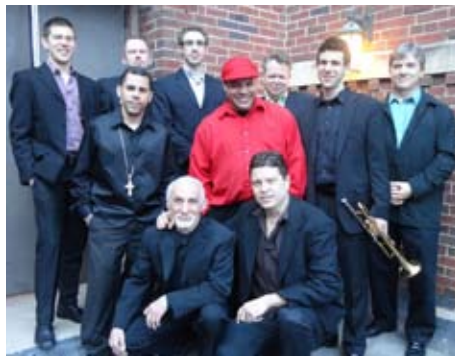
June 18th — Groupo Aye Is an Afro-

As well as playing jazz chart hits, the BLBB is well known for their wide variety of dance music. So dancers, come on up front and strut your stuff!