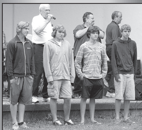
Jazzoo parking attendants