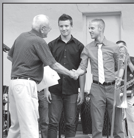
Our 2012 Scholarship winners