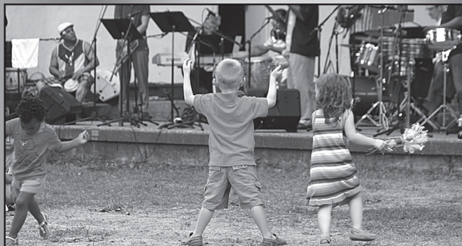
Oh the Joy of Music!