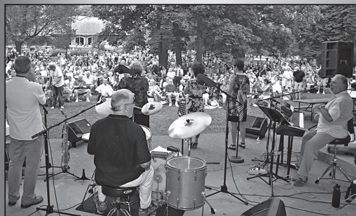
Record Crowds at the Band Shell