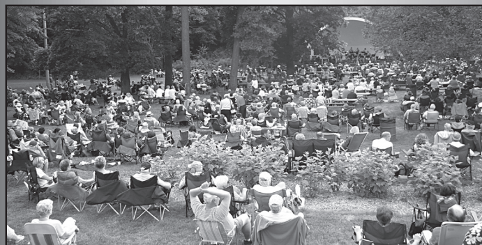
View from the Circle Pavilion