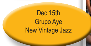
Dec 15th Grupo Aye New Vintage Jazz