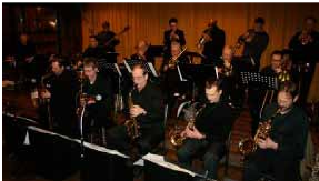
Grand Rapids Jazz Orchestra, August 15