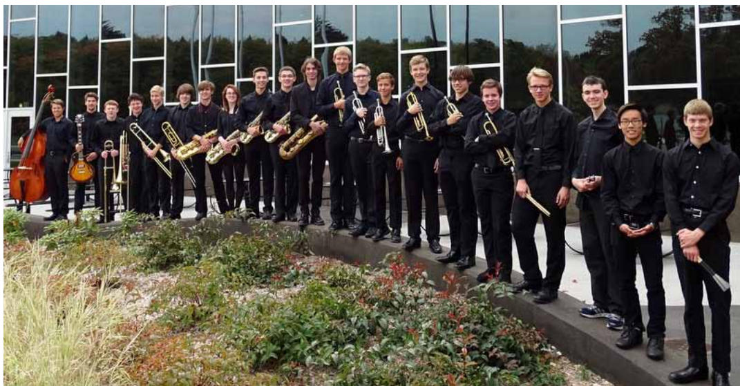
Northview High School Jazz Band, June 6