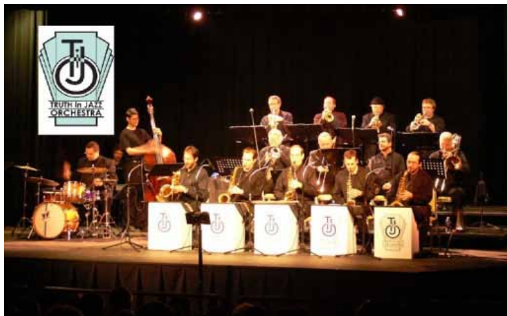
Truth in Jazz Orchestra, June 21 at 920 Watermark

Truth in Jazz Orchestra at 920 Watermark, Muskegon, 7:30-9:30 pm, $5 cover