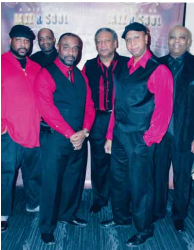
Greenbrook, June 27