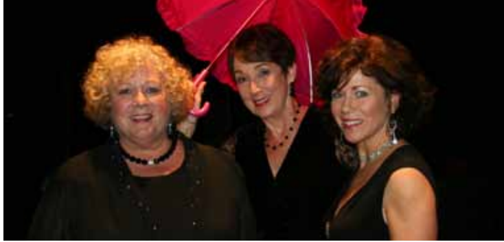
Boogie Woogie Babies, June 11 at the Reuther Pavilion

Entourage at What Not Inn, Fennville, 7-11 pm