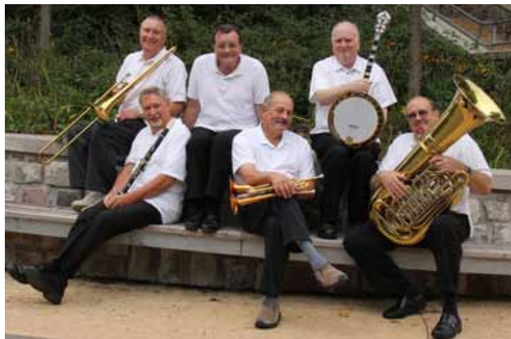
River Rogues, June 19 at New Harmony Hall

River Rogues at New Harmony Hall, 401 Bridge St., 2-4 pm