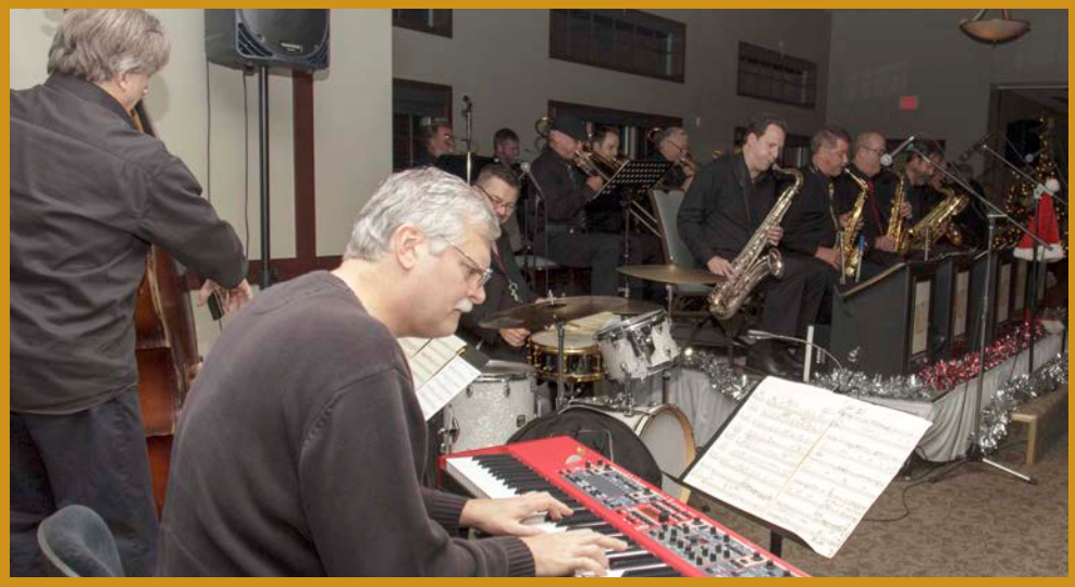
A festive holiday party was held on December 7th where we danced, dined and socialized while listening to the music of Grand Rapids Jazz Orchestra.