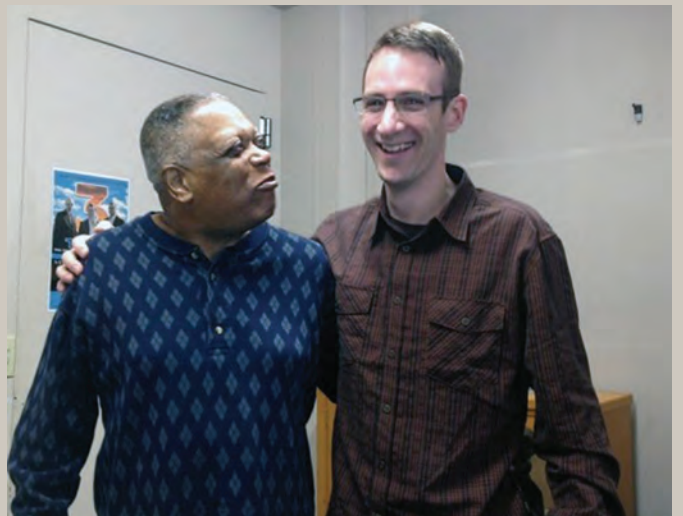
Hanging with my teacher, the legendary drummer, Billy Hart