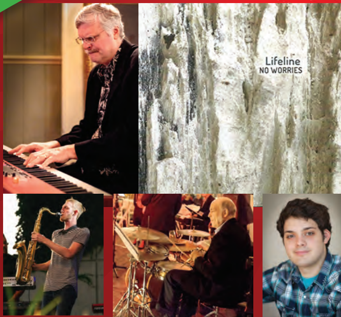
January 20th Monday Night Jazz Gumbo presents "LIFELINE"

Vol. 33 No.06 • 616-490-9506 • www.wmichjazz.org • info@wmichjazz.org