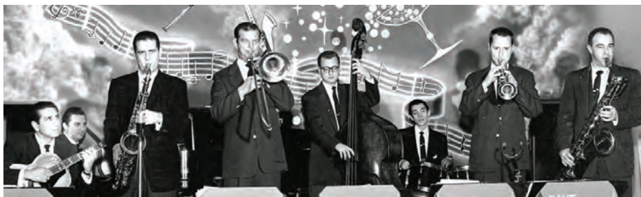
Dave Pell Octet