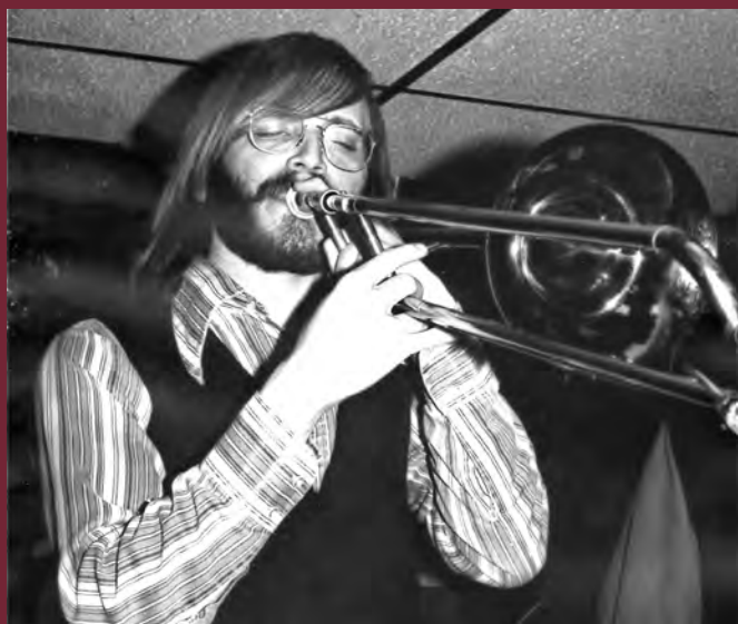
Just 21 years old, 1973!