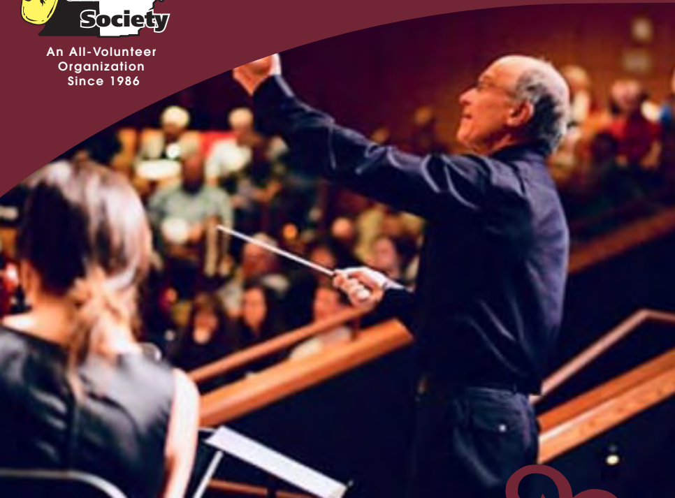
Conducting at Aquinas 2019

Vol. 34 No.02 • 616-490-9506 • www.wmichjazz.org • info@wmichjazz.org