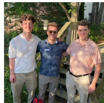
The CJC Band