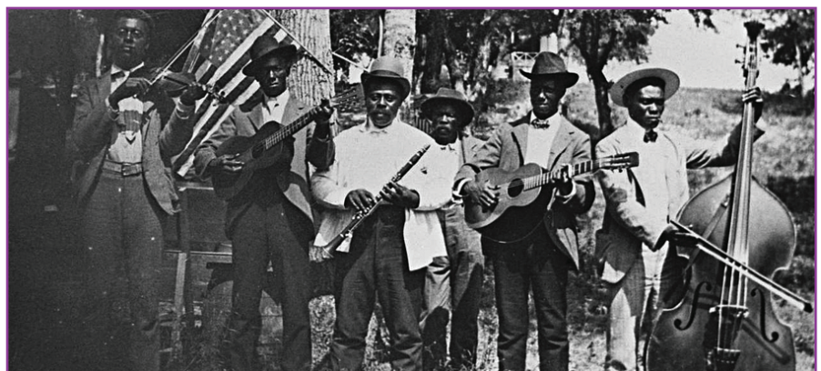
Emancipation Day Celebration band, June 19, 1900, Texas