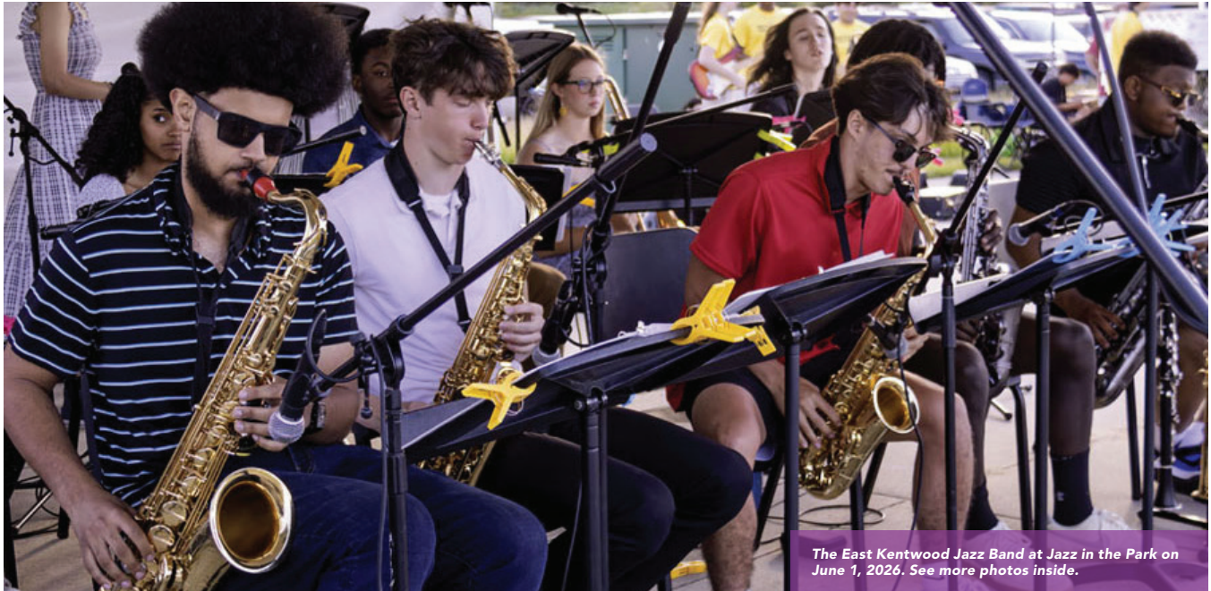
The East Kentwood Jazz Band at Jazz in the Park on June 1, 2026. See more photos inside.